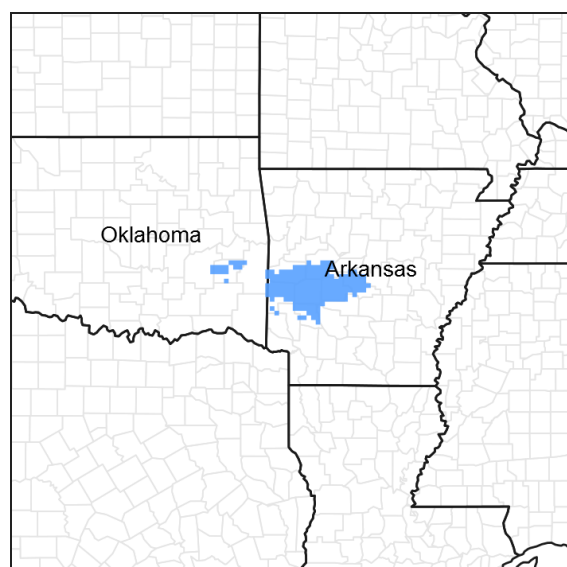
Figure 1. Mapped extent

Provisional. A provisional ecological site description has undergone quality control and quality assurance review. It contains a working state and transition model and enough information to identify the ecological site.