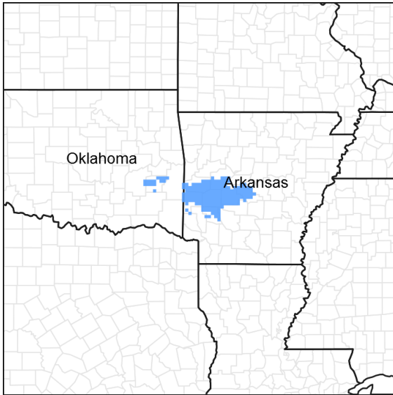
Figure 1. Mapped extent

Provisional. A provisional ecological site description has undergone quality control and quality assurance review. It contains a working state and transition model and enough information to identify the ecological site.