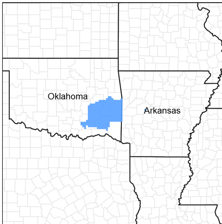
Figure 1. Mapped extent

Provisional. A provisional ecological site description has undergone quality control and quality assurance review. It contains a working state and transition model and enough information to identify the ecological site.