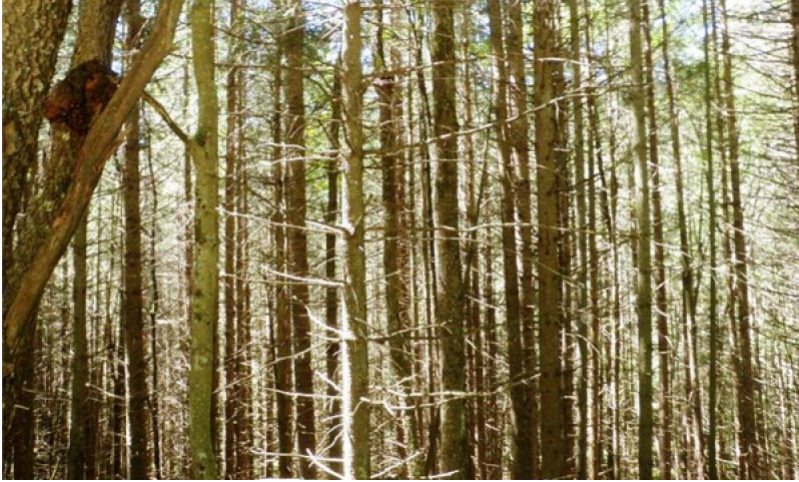
Figure 13. Norway Spruce Plantation

This phase is a plantation planted by the Civilian Conservation Corps and the United States Forest Service during the 1930s and 1940s. The areas were planted to provide timber products and wildlife habitat.