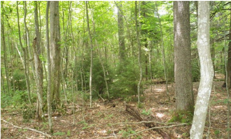
Figure 12. Black Cherry-Maple

This community was created by logging or human-induced , low intensity fire. Indicators of this site are less than 30 percent red spruce overstory canopy cover, with hardwoods co-dominating. Feedbacks maintaining this site are red spruce is suppressed in the understory or absent in the understory. Hardwood leaf litter may inhibit conifer regeneration.