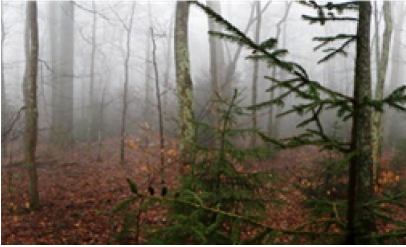
Figure 11. Red Maple-Beech

This community was created by logging followed by human-induced , low intensity fire. Indicators of this site are less than 30 percent red spruce overstory, with hardwoods co-dominating. Feedbacks maintaining this site are red spruce is suppressed or absent in the understory. Hardwood leaf litter inhibits conifer regeneration.