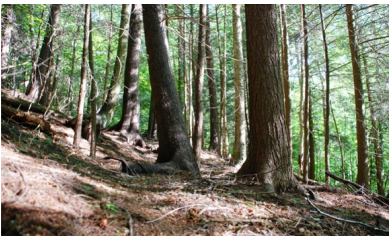
Figure 9. Spodic Shale Upland Conifer Forest