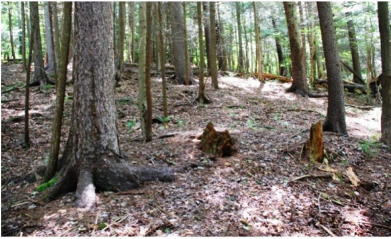
Figure 10. Spodic Shale Upland Conifer Forest structure

This image represents the reference community for the site. The description is based on historical descriptions, site index data, professional consensus of experienced ecologists, and analysis of field work. Old growth forests of this type are very rare. Indicators of this site are greater than 30-50 percent conifer canopy cover (red spruce and eastern hemlock). Spodosol soil order and organic matter accumulation and occurrence of folistic epipedons. Feedbacks that maintain the site are red spruce acidifies the soil, forms spodic horizons, and causes development of thick organic horizons. Thick conifer needle mor creates unfavorable conditions for hardwood regeneration. Feedbacks: red spruce acidifies the soil, forms spodic horizons, and causes development of thick organic horizons. Thick conifer needle mor creates unfavorable conditions for hardwood regeneration.