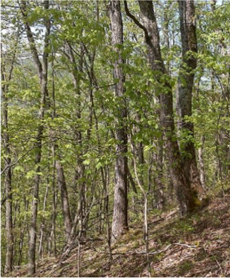
Figure 9. Oak/Heath Forest

Without management, stands may succeed to a more mesophytic forest type dominated by shade tolerant species (i.e. maples and American beech) (Nowacki and Abrams, 2008). Dendroecology studies in old-growth forest stands indicate that oak species have dominated stands for the past 300 years. Researchers speculate that the recent proliferation of maples in the understory will inhibit regeneration of oak under the current disturbance regime (Hart et al. 2012). Oak can regenerate in canopy gaps formed by uprooted trees, but only on very dry sites, indicating that gap-phase dynamics will favor maple overall (Hart and Kupfer 2011). The American chestnut was an important part of this ecological site prior to decimation by the chestnut blight but it is unclear how abundant it would have been. Colloquial estimates based on local names like "Chestnut Ridge" indicate that it may have been prolific.