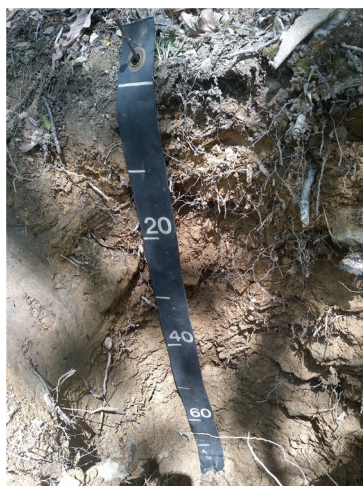
Figure 6. Berks scale centimeters

The soils of this site are dark grayish brown, shallow to moderately deep silt loams and loams and are represented by the Inceptisol soil order. Sandstone and shale fragments and rocks occur in the profile in quantities high enough to classify as skeletal. Rock fragments and bedrock outcrop occur on the soil surface, but not to the extent that they impair the production of native vegetation. Plant-soil moisture relationships are adequate for adapted plants. In healthy condition, rills, gullies, wind scoured areas, pedestals, and soil compaction layers are not present on the site.