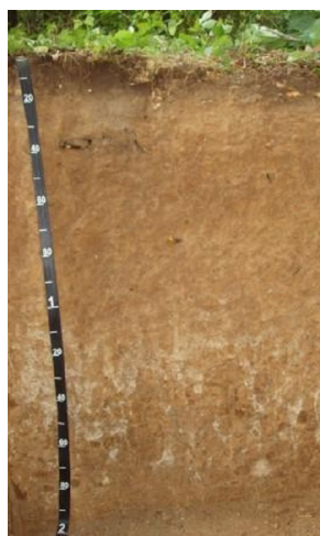
Figure 9. Memphis series

The accompanying picture of the Memphis series shows a dark grayish brown silt loam surface horizon to about 18 cm overlying the brown silt loam to silty clay loam subsoil. Pale silt coats on structural prism faces can be seen below one meter in this picture. scale is in centimeters.