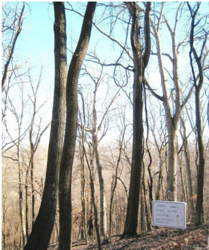
Figure 10. Hart Creek Conservation Area, MDC, Boone Co.