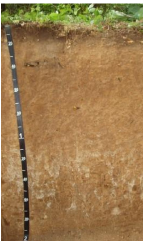
Figure 9. Memphis series

The accompanying picture of the Memphis series shows a dark grayish brown silt loam surface horizon to about 18 cm overlying the brown silt loam to silty clay loam subsoil. Pale silt coats on structural prism faces can be seen below one meter in this picture. scale is in centimeters.