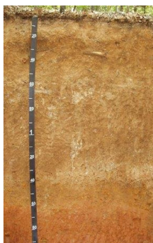
Figure 9. Loring series

The accompanying picture of the Loring series shows a thin surface horizon and a light-colored albic horizon over a brown silt loam subsoil at about 20 cm. A fragipan is below about 55 cm in this picture. The fragipan is a barrier to roots. Picture courtesy of Kevin Godsey and Dan Childress; scale is in centimeters.