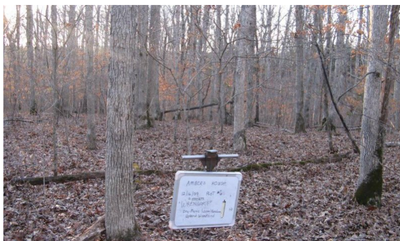
Figure 9. private land, Boone Co.