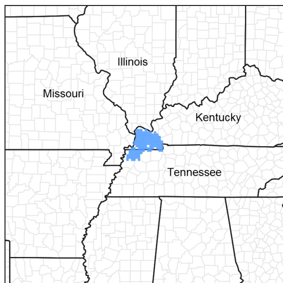
Figure 1. Mapped extent

Provisional. A provisional ecological site description has undergone quality control and quality assurance review. It contains a working state and transition model and enough information to identify the ecological site.