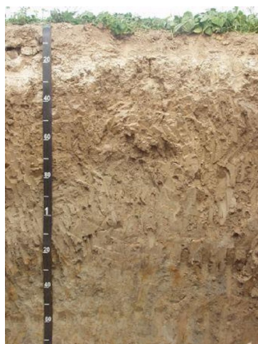
Figure 9. Overcup series

The accompanying picture of the Overcup series shows a thin silt loam surface horizon over a light-colored leached layer called an albic horizon at about 20 cm. Below this is the claypan, a clay horizon that impedes water movement and root penetration. Indicators of seasonal wetness (redoximorphic features) are visible in the lower part of the profile. scale is in centimeters.