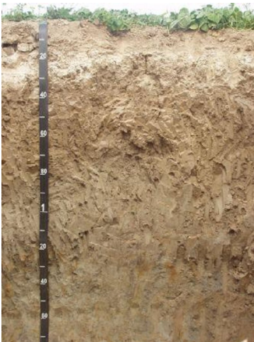
Figure 9. Overcup series

The accompanying picture of the Overcup series shows a thin silt loam surface horizon over a light-colored leached layer called an albic horizon at about 20 cm. Below this is the claypan, a clay horizon that impedes water movement and root penetration. Indicators of seasonal wetness (redoximorphic features) are visible in the lower part of the profile. scale is in centimeters.