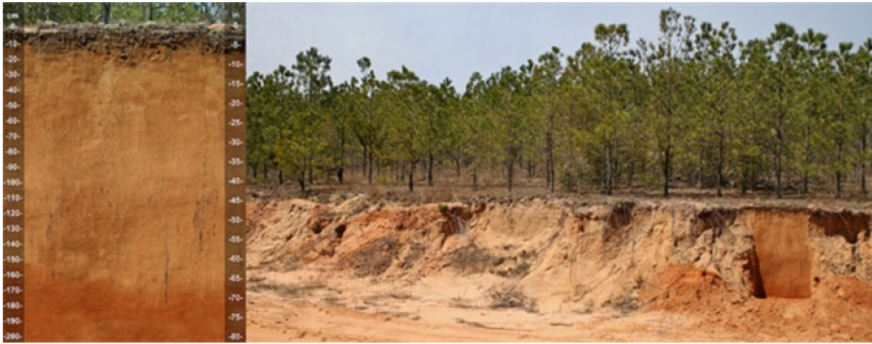
Figure 7. Soil profile of the Troup soil series.