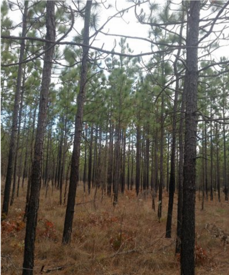
Figure 16. State 5: Young longleaf plantation