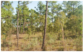
Mature longleaf pine overstory, mid- and understory oak encroachment, in need of fire