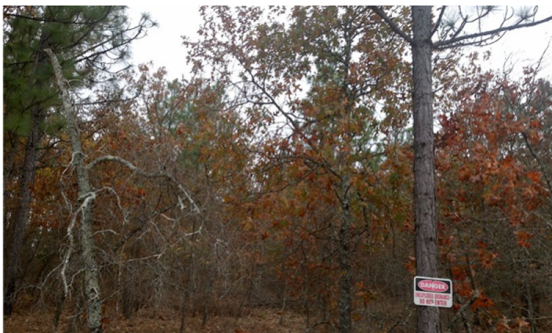
Figure 14. State 3

The canopy of this community phase is usually dominated by turkey oak ( Quercus laevis ) and can have scattered loblolly pine ( Pinus taeda ). Longleaf can still be present, but regeneration is not occurring. Other oaks ( Q. incana , Q. margarettae ), persimmon ( Diospyros virginiana ), and sweetgum ( Liquidambar styraciflua ) are also present. The absence of fuels from pine needles and herbaceous plants will further decrease the ability of the site to carry surface fires and perpetuate the scrub oak-dominated forest.