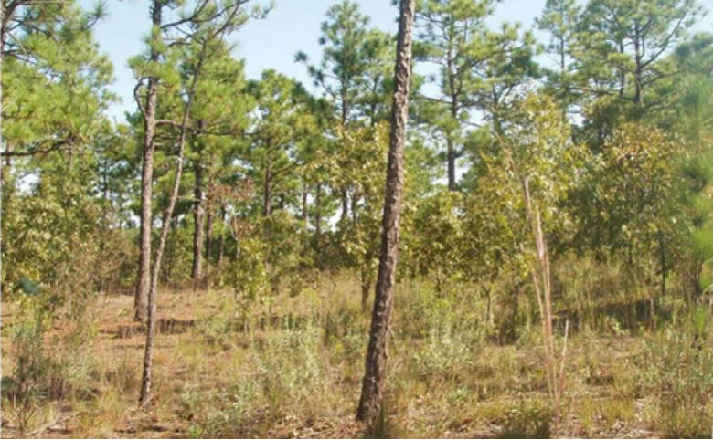
Figure 11. Longleaf pine with accelerating oak encroachment.

This community phase is generally the result of lower fire frequency. Either fire suppression or a change in fire regime (burning every 3 to 5 years, dormant season burns) allows woody vegetation growth in the mid- and understory. Species composition is similar to phase 1.1. The dominant overstory species is longleaf pine, which are widely spaced across the landscape. Because of the buildup of litter and resulting lack of bare mineral soil, longleaf pine regeneration is inhibited. If fire suppression continues, oaks and other hardwoods will thrive, eventually out-competing any young longleaf that have managed to become established. In addition, herbaceous groundcover is not as abundant as in phase 1.1, although species composition is similar. Changes in fire regime result in successful hardwood encroachment, litter accumulation, and a subsequent shift in herbaceous species abundances.