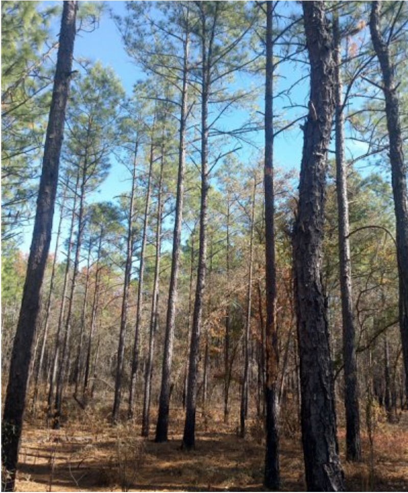
Figure 17. State 6 - Loblolly pine plantation