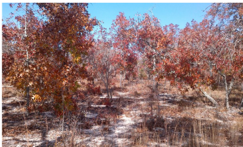
Figure 15. Turkey oak-dominated site at Fort Gordon in GA

This could probably use some fleshing out... This community phase is naturally present in patches within the larger ecological site, most often on microsites that are protected from fire (Frost and Langley, 2008; Edwards et al., 2013). However, long-term fire suppression or lack of forest management can lead to larger spatial coverage of this state (Sorrie, 2011). After continued encroachment of fire-tolerant oaks, longleaf pine reproduction eventually ceases. This leaves the site open for continued scrub oak domination. Fine fuels needed to carry low intensity ground fires are absent, but coarser fuels such as branches and leaves are present.