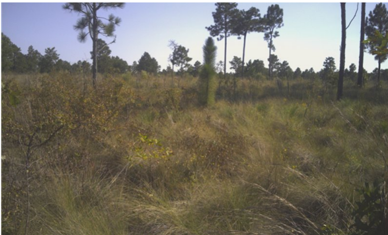
Figure 10. Community Phase 1.1

The overstory of this community is dominated by widely-spaced mature longleaf pine. Typical pine canopy cover ranges from 5 to 40 percent. Canopies are open and trees are uneven-aged but the community also includes variably-sized openings with even-aged trees. These openings result from windstorms, timber harvest, hot fires, or insect-induced mortality. For longleaf pine seed germination to occur, abundant light and bare soil are needed. These conditions are found in canopy gaps immediately following fire events. Common mid-story vegetation cover is generally sparse and composed mainly of oak species. Turkey oak ( Quercus laevis ) is the most common, followed by bluejack ( Q. incana ) and dwarf post oak ( Q. margarettae ). Some oaks can persist even though frequent fire discourages hardwood establishment. For most sites, a fire return interval of two to three years prevents hardwood invasion (Edwards et al., 2013). Species richness is high in the herbaceous understory of these communities (Peet and Allard, 1993). Wiregrass ( Aristida species) is the dominant grass, but bluestems ( Schizachrium and Andropogon species), and rosette grass ( Dicanthelium sp.) can also be found. Georgia bear grass ( Nolina georgiana ), a rare species, is also found in dry longleaf pinelands (Sorrie, 2011). Grass-dominated groundcover provides necessary fine fuels for the spread of surface fires. Frequent low intensity fire is necessary for the perpetuation of this community phase.