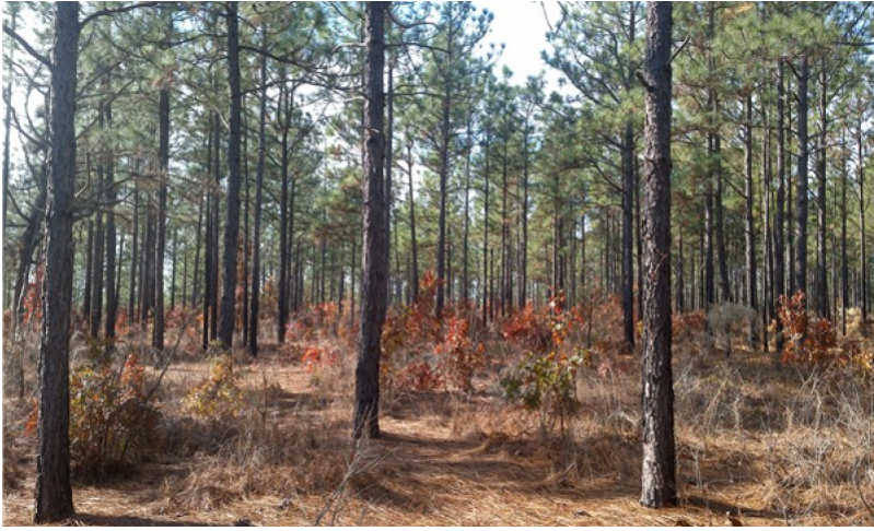
Figure 9. Fort Gordon, GA red-cockaded woodpecker site