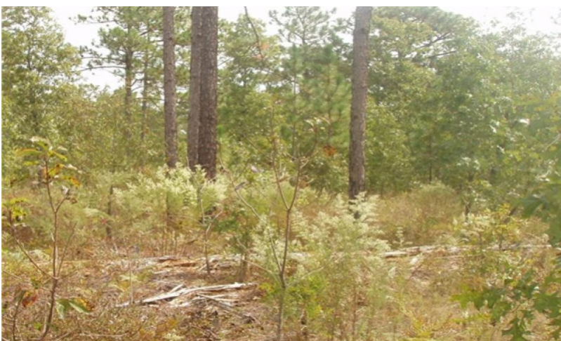
Figure 12. State 2

More than five years of fire suppression crosses a threshold from state 1 to state 2. This state is characterized by scattered longleaf pine. Continued fire suppression allows turkey oak seedlings to reach basal diameters greater than four inches, which allows the hardwoods to resist surface fires that may occur. Thus, turkey oak cover begins to rival that of longleaf pine, and, due to lack of longleaf pine regeneration will become dominant. Loblolly pine ( Pinus taeda ) may also begin to encroach. Herbaceous species richness suffers from continued fire suppression. Increased shade negatively impacts native groundcover as hardwood coverage continues to expand. The result is