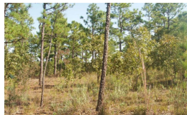
Mature longleaf pine overstory, mid- and understory oak encroachment, in need of fire

A fire frequency of two to three years controls encroaching hardwood trees and shrubs. Longleaf pine seed germination is promoted by eliminating thick litter layer development. Extended fire suppression or fire regime alteration will cause community phase 1.1 to transition to community phase 1.2. If the fire return interval persistently exceeds three years or fires occur during the dormant season, encroaching hardwoods will become well established. Longleaf pine seed germination will be severely inhibited due to litter accumulation and lack of bare soil.