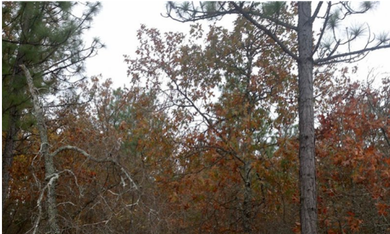
Figure 13. State 3, cropped image