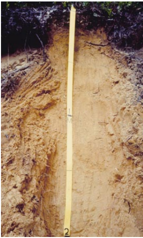
Figure 7. Lakeland soils comprise over 115,000 acres of this