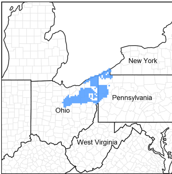
Figure 1. Mapped extent

Provisional. A provisional ecological site description has undergone quality control and quality assurance review. It contains a working state and transition model and enough information to identify the ecological site.