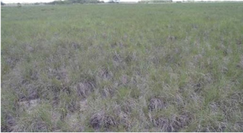
Figure 9. 1.2 Cordgrass Prairie Community

Gulf cordgrass dominates this plant community and will make up a significant portion of the total annual production. Grasses like purple dropseed ( Sporobolus purpurascens ), brownseed paspalum ( Paspalum plicatum ), Hartweg's paspalum ( Paspalum hartwegianum ), fringed signalgrass ( Urochloa ciliatissima ), and red lovegrass ( Eragrostis secundiflora ) will make up a portion of the plant composition. Gulf cordgrass can be an excellent emergency forage for cattle if managed through prescribed fire and prescribed grazing. Overall, bare ground and litter cover will remain relatively constant from the Reference Plant Community (1.1) to the Cordgrass Prairie Community (1.2) because of the high herbaceous production of gulf cordgrass.