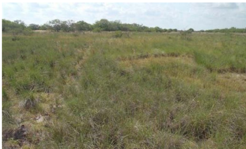
Figure 11. 2.1 Woody Encroachment Community

The woody plant species of this area are not well adapted to the edaphic conditions of this ecological site. Periodic water inundation and a seasonal water table create barriers to seedling germination and affect the longevity of plants that do establish. Under the right circumstances, woody plants including mesquite and huisache ( Acacia farnesiana ) will grow on this ecological site, but their growth is stunted and plant mortality is high. A significant woody canopy cover is not typical for this ecological site. In rare circumstances, areas may not experience periodic water inundation or may no longer have a seasonal water table. Woody species will be more common and longer lived in these situations.