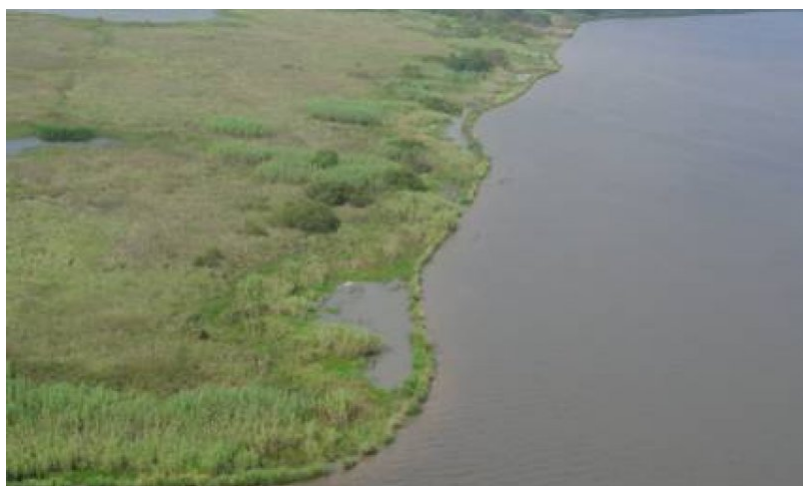
Figure 8. Planted Smooth Cordgrass

Smooth cordgrass can be vegetatively established in the inter-tidal zone. This is a labor intensive and expensive process that involves planting vegetative shoots in two rows on a two foot spacing. The first row should be planted at the mean high (MHT) line, and the second row planted two feet toward open water from the first row. This practice has a relatively low success rate, but when the process is successful, it is effective in preventing shoreline erosion. Occasionally, smooth cordgrass will spread beyond the establishment zone, however, establishment by seed from established plants requires freezing temperatures to stratify the seed and improve seed viability. Without freezing stratification, germination is only about 30%. Freezing weather is a rare occurrence in Louisiana coastal marshes. Excessive wave action and storm surges may cause planted strands of smooth cordgrass to revert open water.