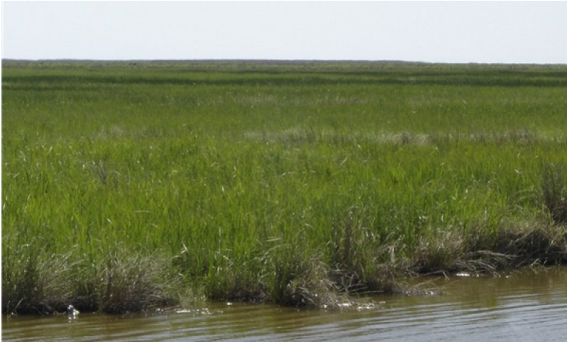
Figure 5. BFL1