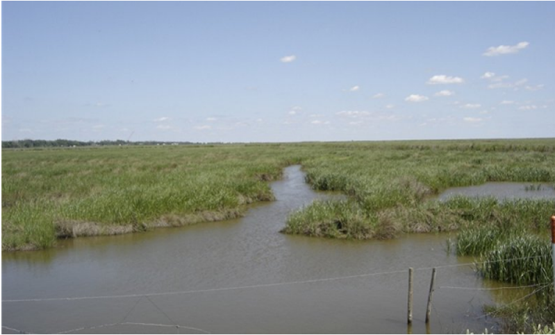
Figure 14. BFL3

This is usually a terminal state due to the extreme cost and complexity of obtaining reclamation permits and the cost of installing water control structures. Once this site has reverted to open water, it is not generally economically feasible or practical for individual landowners to reclaim it with current technology. The plant community consists primarily of submerged and floating aquatic plants such as widgeongrass.