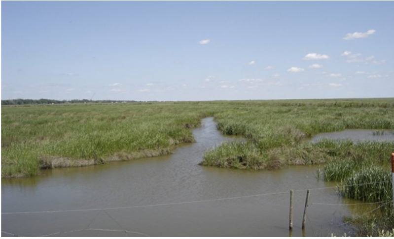
Figure 14. BFL3

This is usually a terminal state due to the extreme cost and complexity of obtaining reclamation permits and the cost of installing water control structures. Once this site has reverted to open water, it is not generally economically feasible or practical for individual landowners to reclaim it with current technology. The plant community consists primarily of submerged and floating aquatic plants such as widgeongrass.