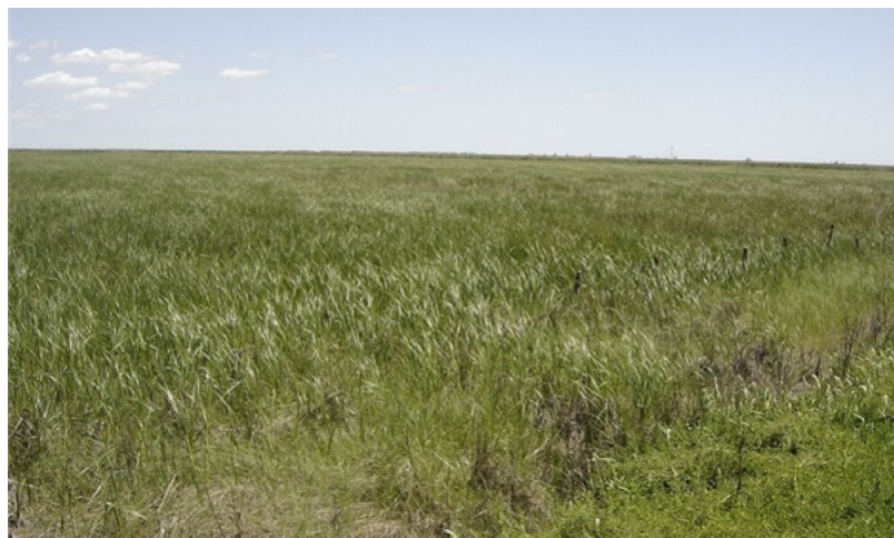
Figure 10. BFL2

Marsh plants exist in a delicate balance with water depth and salinity levels. When this balance is altered, the plant community adapts to the new regime. The mixed grass plant community is dominated by marshhay cordgrass. As depth of water increases and the period of saturation and/or inundation increases, the plant community becomes more diverse as marshhay cordgrass declines and sod-forming grasses increase on the site. California bulrush (bullwhip), Olney bulrush (three-corner grass), and cattails also increase. Seashore saltgrass and seashore paspalum occupy the drainageways within the site. As depth of water increases and the period of saturation and/or inundation increases, the plant community becomes more diverse as marshhay cordgrass declines and sod-forming grasses increase on the site. California bulrush (bullwhip), Olney bulrush (three-corner grass), and cattails are found in the fresher areas and deeper water areas of this site. As water depth increases, these species can develop extensive communities. When this regime persists, open water areas begin to appear between plants and may eventually cause marsh “breakup”. As marsh “breakup” occurs sheet erosion increases due to tidal flow. This increased erosion results in increased water depth and duration of inundation. Widgeongrass is an aquatic species