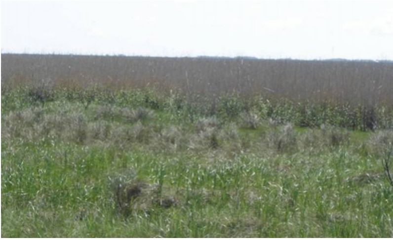
Figure 15. Salt Grass Community

As salinity increases, the less salt tolerant species begin to decline. If water depth remains constant, and uncontrolled grazing continues, marshhay cordgrass is replaced by more salt tolerant species. Seashore saltgrass is more salt tolerant and can tolerate more intense grazing pressure. As a result, it increases significantly and becomes the dominant species. Spikerush, saltmarsh bulrush, and Olney bulrush increase initially, however, grazing pressure will prevent them from becoming dominant. Smooth cordgrass may begin to appear on the fringes of the brackish marsh where salt concentrations are highest.