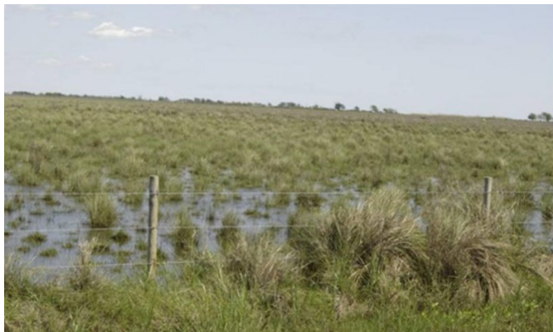
Figure 4. Marshhay Cord/Seashore Paspalum