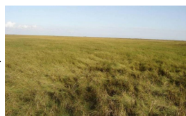
Marshhay cordgrass Community