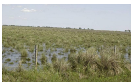
Marshhay Cordgrass/Bulrush/Seashore Paspalum Community