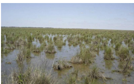
Mixed Grass Community