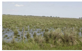
Marshhay Cordgrass/Bulrush/Seashore Paspalum Community

prescribed burning during the correct season to benefit the desired vegetation, followed by prescribed grazing if livestock are present