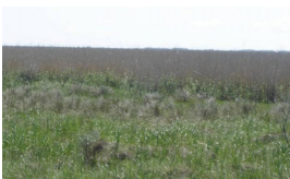
Salt Grass Community