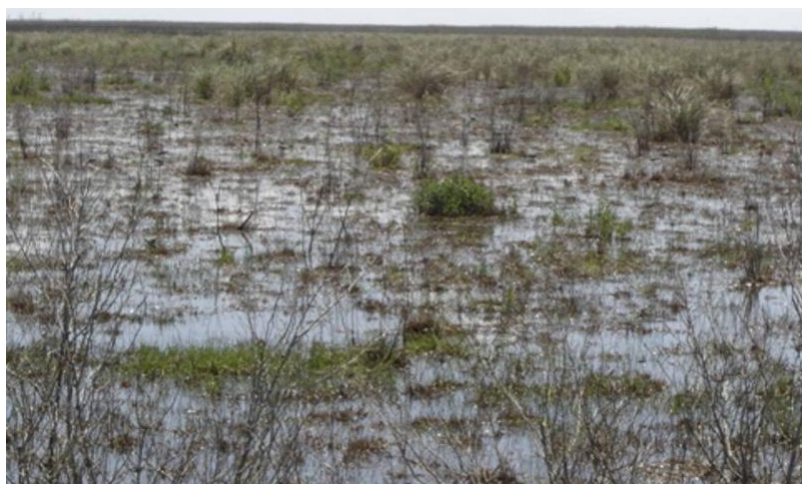
Figure 17. Annual Grass and Forb

This plant community occurs where there has been abusive grazing by cattle or wildlife. These areas are locally known as "eat outs". In the most extreme cases, virtually all perennial plants are grazed out, and often even the roots are consumed. These areas often have the appearance of being plowed. The resulting bare ground allows the site to be invaded by unwanted plant species. Bigleaf sumpweed and eastern baccharis are early invaders. Fire must be closely monitored to minimize intense grazing pressure when trying to restore this area to a higher state. Geese and furbearers concentrate on areas that have been recently burned. Excessive and/or abusive grazing by furbearers, geese, or cattle eventually result in a severely degraded plant community characterized by annual grasses and forbs, lower successional perennial grasses and forbs, and a significant increase in shrubs such as baccharis and bigleaf sumpweed.