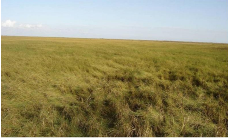
Figure 7. Marshhay Cordgrass

The absence of fire and/or grazing results in a plant community that is dominated by marshhay cordgrass to the almost total exclusion of other species. It may comprise 75% or more of the total vegetation. The almost complete foliar cover of marshhay cordgrass gives the area the appearance of a monoculture. Rushes, sedges, low-growing sod-forming grasses, a few forbs and scattered shrubs comprise the remainder of the vegetation in this phase. Seashore saltgrass is only present in the deeper internal drainageways on the site. These conditions make this plant community susceptible to erosion. Energy created by tidal fluctuations is not dampened and the ground cover only consists of the basal stools of marshhay cordgrass.