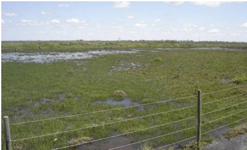
Figure 10. Sod Forming Grasses

Uncontrolled grazing by cattle and wildlife can result in a sod-forming plant community rather than a bunchgrass plant community. This is especially true when uncontrolled grazing takes place immediately following a burn. Wildlife, such as geese and furbearers have been known to eliminate or severely reduce marshhay cordgrass from the site. As marshhay cordgrass and other bunchgrasses decline, sod-forming grasses such as seashore paspalum and seashore saltgrass become the dominant species. Dwarf spikerush is one of the earliest species to come into the overutilized brackish marshes. Bigleaf sumpweed and eastern baccharis begin to increase noticeably. Once the site has deteriorated to this state, it is highly unlikely that it can ever return to the previous state through management alone. This is because of the intense competition from the sod-forming grasses.