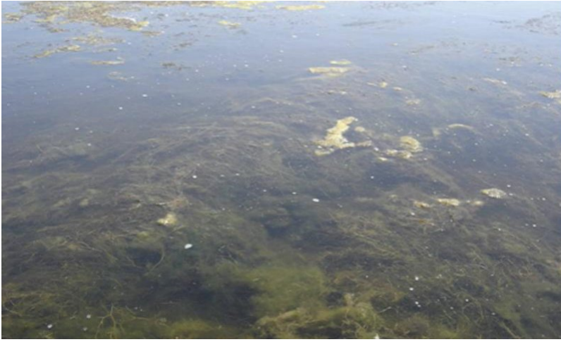
Figure 19. Aquatic Community

This is usually a terminal state due to the extreme cost and complexity of obtaining reclamation permits and the cost of installing water control structures. Once this site has reverted to open water, it is generally not economically feasible or practical for individual landowners to reclaim it with current technology. The plant community consists primarily of submerged and floating aquatic plants such as widgeongrass. Some emergent plants may exist in shallower water areas.