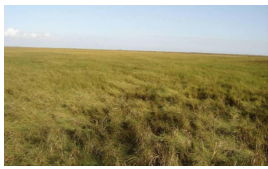
Marshhay cordgrass Community