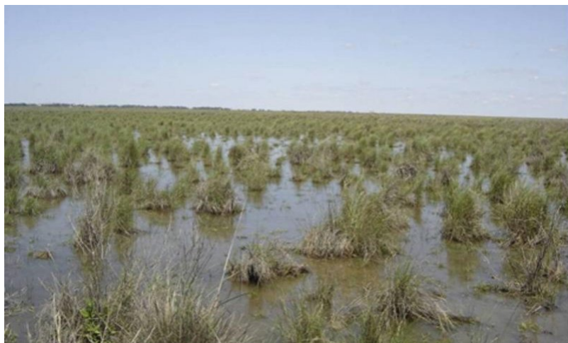
Figure 13. Mixed Grassland

Marsh plants exist in a delicate balance with water depth and salinity levels. When this balance is altered, the plant community adapts to the new regime. The mixed grass plant community is dominated by marshhay cordgrass. Seashore saltgrass and seashore paspalum occupy the drainageways within the site. As depth of water increases and the period of saturation and/or inundation increases, the plant community becomes more diverse as marshhay cordgrass declines and sod-forming grasses increase on the site. California bulrush (bullwhip), Olney bulrush (three-corner grass), and cattails are found in the fresher areas and deeper water areas of this site. As water depth increases, these species can develop extensive communities. When this regime persists, open water areas begin to appear between plants and may eventually cause marsh "breakup". As marsh "breakup" occurs sheet erosion increases due to tidal flow. This increased erosion results in increased water depth and duration of inundation. Widgeongrass is an aquatic species which is often found in the open water areas where a water control plan has been implemented to control water depth and salinity.