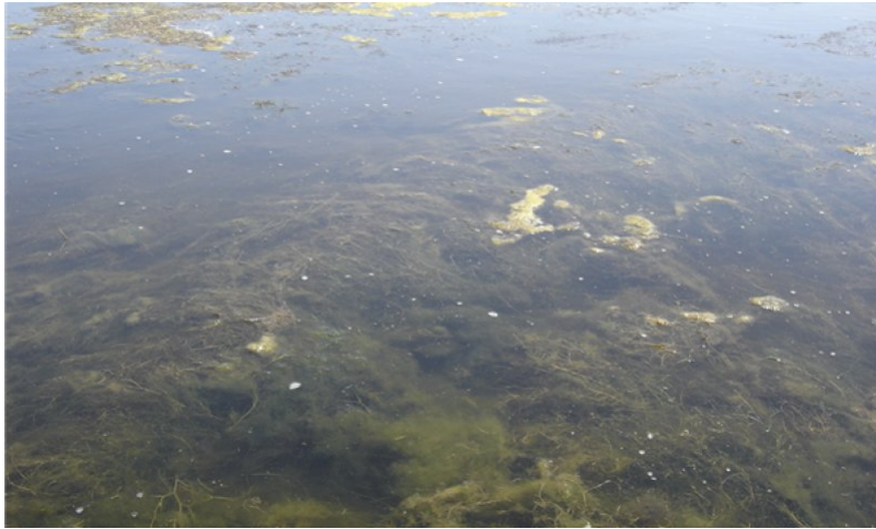
Figure 23. Aquatic Community

As the marsh breaks up, increased water depth precludes the establishment of grasses and the site is transformed into open water. At this stage, widgeongrass and floating, submerged aquatic plants are dominant. A few emergent plants may persist in the shallower water areas. This is a terminal State. Without the implementation of extraordinary conservation or restoration activities, open water will increase into adjacent emergent marsh.