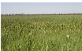
California Bulrush/Giant Cutgrass/Cattail Community