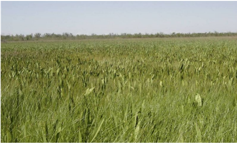
Figure 10. Fresh Fluid Mineral Marsh - 2.1 Community

Marsh plants exist in a delicate balance with water depth and salinity levels. When either of these factors is altered, the plant community adapts to the new regime. As water depth increases, the marsh begins to break up and open water areas increase. The plant species composition is altered in a predictable sequence. As maidencane and Jamaica sawgrass decline, they are replaced by California bulrush, giant cutgrass, cattail, bulltongue, and alligatorweed. As these changes occur plants may exist as individuals rather than in colonies. These changes occur in the following sequence: When water depths exceed 3 inches, maidencane is significantly reduced. Jamaica sawgrass declines as water levels exceed 6 inches. California bulrush and giant cutgrass will persist until water depths exceed 12 inches. Cattail will withstand water depths up to 18 inches. Eventually, only colonies of plants that can persist in deeper water will remain.