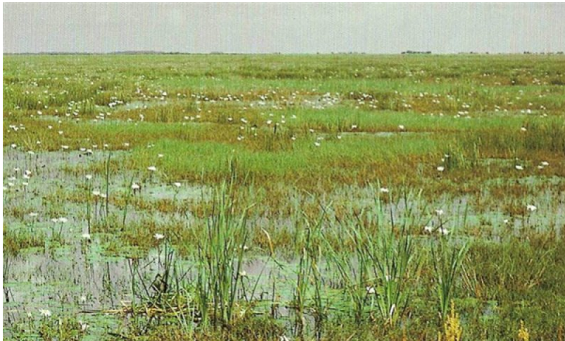
Figure 17. Fresh Fluid Mineral Marsh - 3.1 Community

Increased water depth or destructive grazing by wildlife will cause the marsh to start breaking up. This will eventually result in a community dominated by open water. Bulltongue becomes a dominant plant species. California bulrush and giant cutgrass will still be present in areas where water is less than 12 inches deep. Cattail can withstand water depths up to 18 inches. Aquatic plants including alligatorweed, American lotus, water lily and submergent aquatic species begin to dominate the deeper water areas