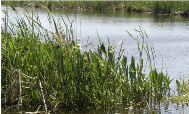
Figure 16. Fresh Fluid Mineral Marsh - 3.1 Community