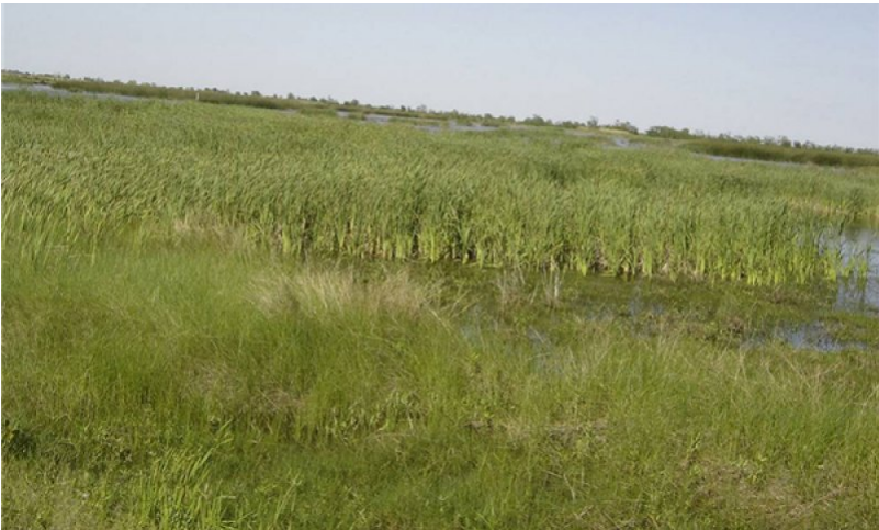
Figure 20. Transition Marsh Community

As salinity levels approach 4 ppt, virtually all of the fresh marsh vegetation dies out. More salt tolerant species such as marshhay cordgrass, spikerush, seashore paspalum, and seashore saltgrass may begin to establish on this site if the plant materials are available from adjacent marsh sites. When this transition occurs the fresh marsh site is actually being converted into an intermediate marsh ecological site.