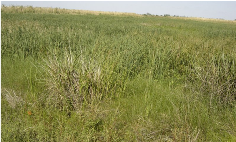
Figure 13. Fresh Fluid Mineral Marsh - 2.2 Community

The fresh marsh is extremely sensitive to increases in salinity. The salinity level of the Fresh Firm Mineral Marsh is consistently less than 3 ppt, and is optimally less than 1 ppt. As salinity increases, the less salt tolerant species begin to decline. Maidencane declines when salinity is consistently greater than 1 ppt. Giant cutgrass can't tolerate salinity levels greater than 2 ppt. California bulrush will persist in salinity up to 3 ppt. Jamaica sawgrass and cattail are more salt tolerant and will persist when salinity levels are 4 ppt., which grades into an intermediate marsh site. As fresh marsh plants begin to decline from the plant community, more salt tolerant species such as marshhay cordgrass, seashore paspalum, and spikerush begin to appear. This depends on the availability of plant material from adjacent sites