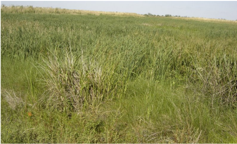
Figure 13. Fresh Fluid Mineral Marsh - 2.2 Community

The fresh marsh is extremely sensitive to increases in salinity. The salinity level of the Fresh Firm Mineral Marsh is consistently less than 3 ppt, and is optimally less than 1 ppt. As salinity increases, the less salt tolerant species begin to decline. Maidencane declines when salinity is consistently greater than 1 ppt. Giant cutgrass can't tolerate salinity levels greater than 2 ppt. California bulrush will persist in salinity up to 3 ppt. Jamaica sawgrass and cattail are more salt tolerant and will persist when salinity levels are 4 ppt., which grades into an intermediate marsh site. As fresh marsh plants begin to decline from the plant community, more salt tolerant species such as marshhay cordgrass, seashore paspalum, and spikerush begin to appear. This depends on the availability of plant material from adjacent sites