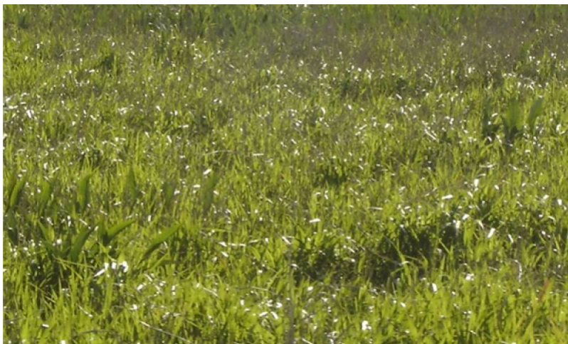
Figure 7. Fresh Fluid Mineral Marsh - 1.1 Community