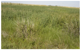
Mixed Grass/Salt Tolerant Grass Community