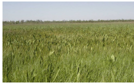
California Bulrush/Giant Cutgrass/Cattail Community

Salinity levels decreased to less than 1.5 PPT.