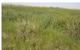
Mixed Grass/Salt Tolerant Grass Community

Salinity increases to greater than 1.5 PPT.