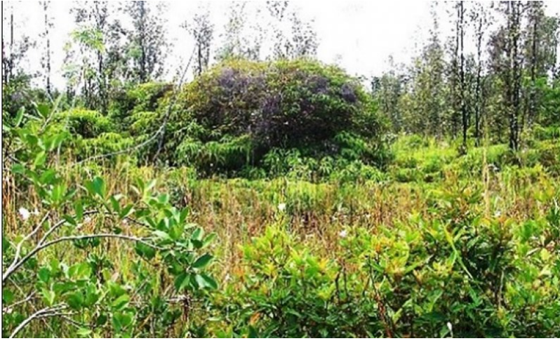
Figure 16. Open weedy site.

This community phase has a wide diversity of mostly introduced species. Some locations are nearly covered by dense stands of large shrubs. Native uluhe fern ( Dicranopteris linearis ) often forms dense thickets.