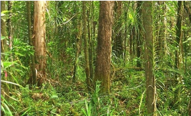
Figure 8. Reference community phase. 6/2/06 D Clausnitzer MU659

The tall overstory consists of ohia lehua ( Metrosideros polymorpha ). The secondary tree canopy consists of a mix of wet environment species and dry environment species. Joseph Rock (1913) described this in the early 20th Century: “Diospyros (lama tree) in lowland forest is especially common back of Hilo along the road to Oloo” (=Keaau), and “Immediately back of Hilo is a somewhat mixed forest composed of species of trees peculiar to the dry and wet regions.” Tree ferns are common. Vines are moderately abundant, particularly ieie ( Freydenetia arborea ), both on the ground and on trees. Large bird’s nest ferns ( Asplenium nidus ) are common on trees and on the ground, but mostly at lower elevations. The mid-canopy is dominated by pandanus or Tahitian screw pine ( Pandanus tectoria ) trees near the coast; this species becomes less common with distance from the coast. Pandanus seems to be moderately invasive, and may be more common on previously disturbed sites or where it was encouraged by the Polynesians in the past. The forests of this ecological site have standing live timber of 500 to 8000 cubic feet per acre, with a representative value of about 1500 cubic feet per acre.