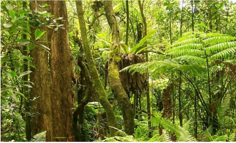
Figure 7. Reference community phase. 6/2/06 D Clausnitzer MU659