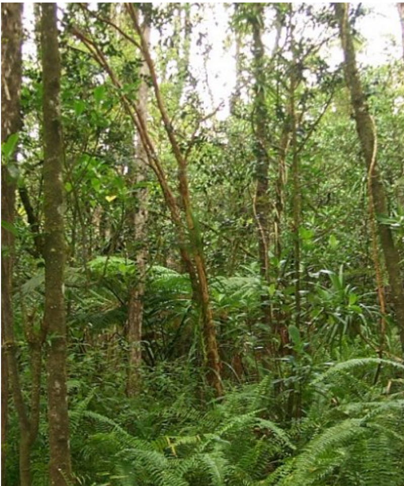
Figure 10. Introduced fern understory. D Clausnitzer generic photo