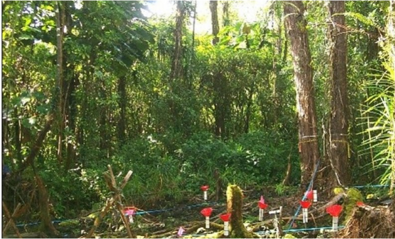
Figure 9. Invaded understory behind cleared plot. 12/8/05 D Clausnitzer MU628

`Ohi`a lehua - strawberry guava/hapu`u/Asian melastome