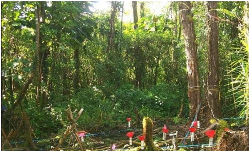
Figure 9. Invaded understory behind cleared plot. 12/8/05 D Clausnitzer MU628

`Ohi`a lehua - strawberry guava/hapu`u/Asian melastome