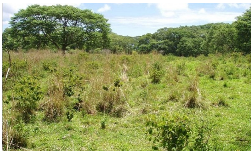
Figure 15. Hilograss and shrub-invaded grassland. 4/19/05 D Clausnitzer generic photo

This community phase is dominated by grasses of lower forage value. Desirable forage legumes largely have been grazed out, and weedy forbs and shrubs have increased. It can be shifted back to phase 4.1 by using a prescribed grazing plan.