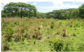
Hilograss - broomsedge bluestem/sourbush