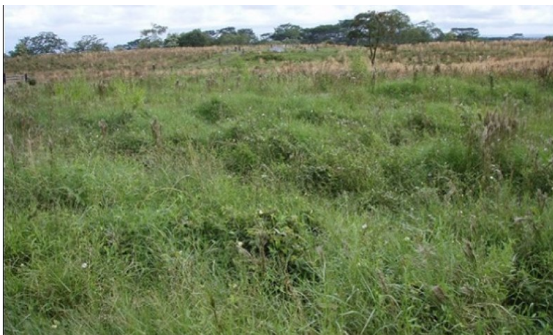
Figure 13. Californiagrass is dominant in foreground.

Landowners choose to establish a dominant forage grass species from the options of suitable species for this community phase. Dominance of desired forage species is maintained by prescribed grazing techniques that allow desired species time to recover from grazing and trampling, but includes periods of grazing of sufficient intensity to