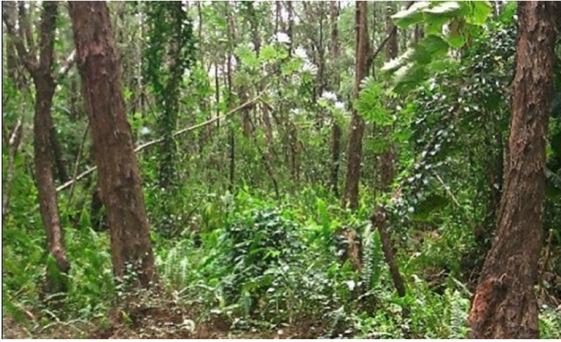
Figure 12. Invaded over- and understory.

Tall ohia lehua ( Metrosideros polymorpha ) persist until they die but do not successfully reproduce. A few native species including kopiko, tree ferns, pandanus, and bird's nest ferns are able to reproduce and maintain low populations. The introduced species present on different sites varies, but strawberry guava, melastomes, and albizia are typically present.