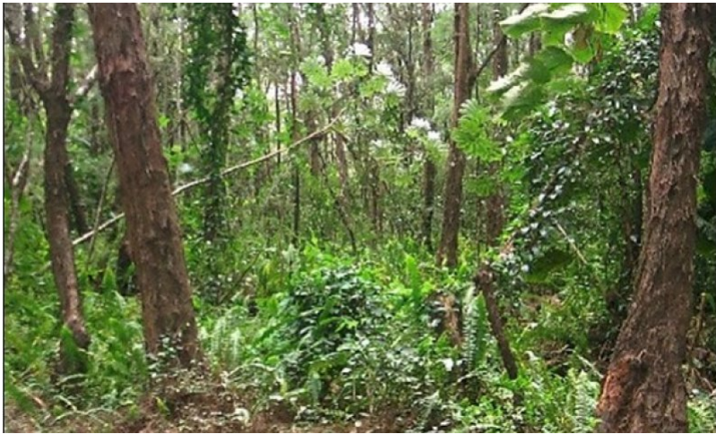
Figure 12. Invaded over- and understory.

Tall ohia lehua ( Metrosideros polymorpha ) persist until they die but do not successfully reproduce. A few native species including kopiko, tree ferns, pandanus, and bird’s nest ferns are able to reproduce and maintain low populations. The introduced species present on different sites varies, but strawberry guava, melastomes, and albizia are typically present.