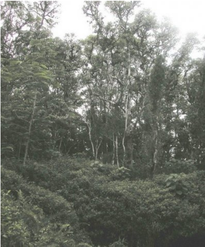
Figure 11. Melastome understory. 1/18/07 D Clausnitzer generic photo

While native trees still dominate the overstory, introduced tree species are beginning to grow into the secondary overstory. Litter from nitrogen-fixing albizia ( Falcataria moluccana ) produces a favorable environment for fast-growing introduced species. Smaller, shade-tolerant introduced trees and shrubs gradually produce extremely dense canopies and root systems that exclude other species. Dense stands of introduced ferns form a layer that inhibits reproduction of native species.