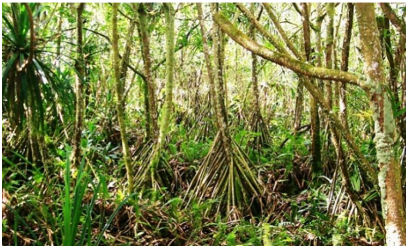
Figure 9. Pandanus-dominated site. 1/12/06 D Clausnitzer MU667

The general aspect is a forest with an open or closed upper canopy 20 to 30 feet (6 to 9 meters) tall, a secondary canopy 8 to 15 feet (2.5 to 4.5 meters) tall, and a sparse understory of shrubs, forbs, and vines. These forests have standing live timber of 150 to 800 cubic feet per acre, with a representative value of about 250 cubic feet per acre.