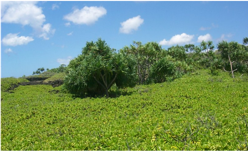
Figure 7. Coastal strip of naupaka and pandanus.