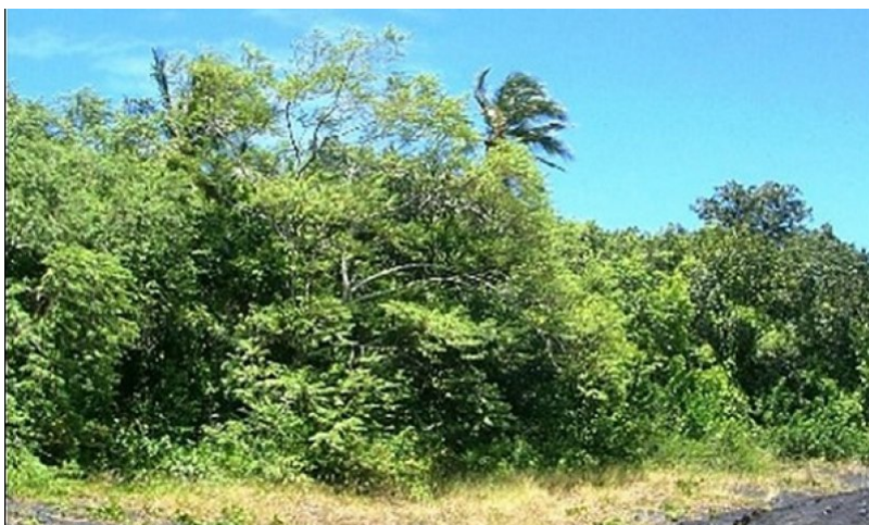
Figure 10. Weed tree overstory. 6/20/06 D Clausnitzer MU670

This community phase is a forest with an open to closed upper canopy of mostly introduced trees 50 to 80+ feet (15