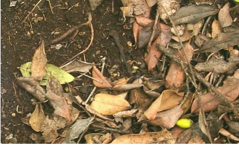
Figure 6. Lama leaf litter on soil surface. 4/25/05 D Clausnitzer MU670