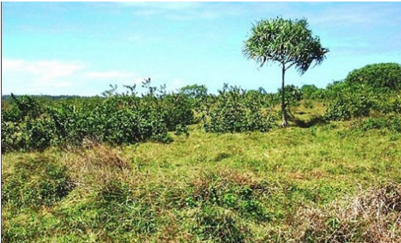
Figure 14. Grassland; invaded by shrubs in background.

This community phase is used for cattle grazing. Dominance of desired forage species is maintained by prescribed grazing techniques that allow desired species time to recover from grazing and trampling, but includes periods of grazing of sufficient intensity to suppress invasion of weedy shrubs and trees.