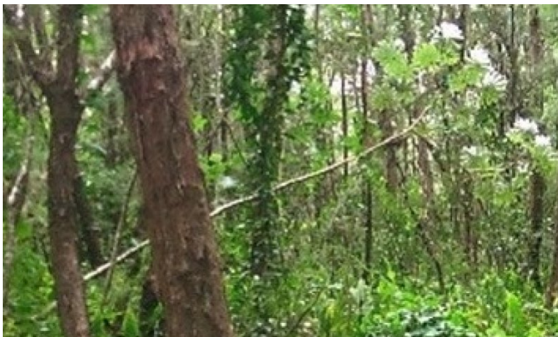
Figure 11. Weedy forest.

This community phase is a forest with a closed to open upper canopy of introduced trees 60 to 120 feet (18 to 37 meters) tall, a secondary canopy of introduced trees of various heights, and a mixed understory of mostly introduced shrubs, vines, ferns, and grasses.