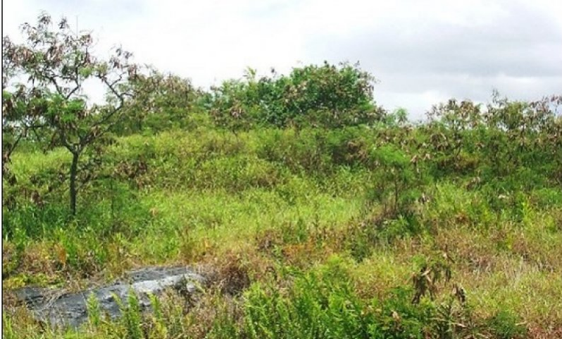
Figure 12. Invaded grassland. 6/20/06 D Clausnitzer MU670