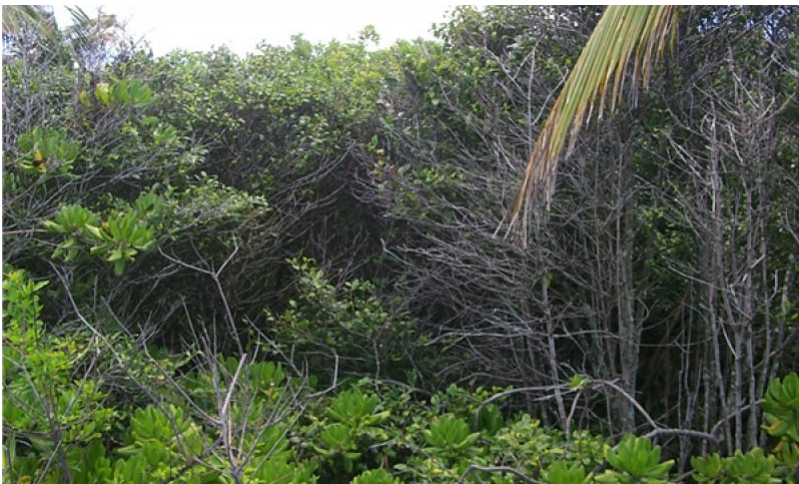
Figure 8. Abrupt naupaka-alahee boundary at coast.