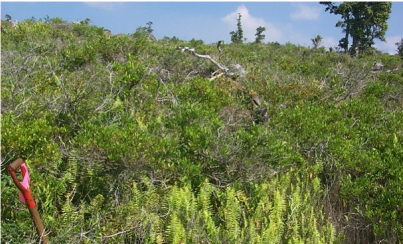
Figure 13. Burned site; aalii and invasive ferns. 1/14/05 MU754

This community phase has a wide diversity of mostly introduced species.