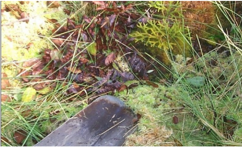
Figure 10. Closeup of sphagnum surface. 11/8/06 D Clausnitzer MU426