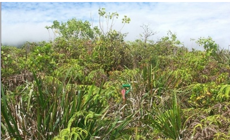
Figure 6. Reference community state. 11/1/06 D Clausnitzer MU426