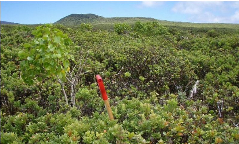
Figure 9. Typical canopy height. 11/1/06 D Clausnitzer MU426