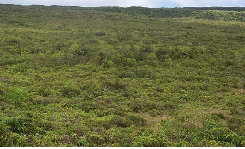
Figure 7. Landscape view. 11/3/06 D Clausnitzer generic photo