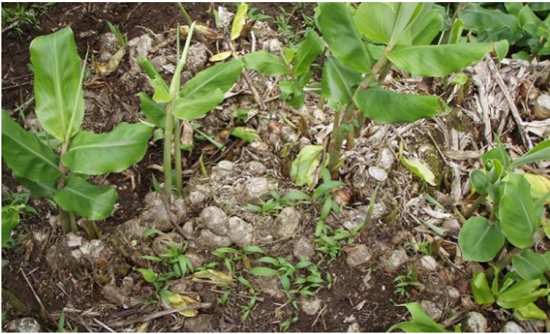
Figure 17. Closeup of ginger root system on soil surface. 9/11/08 D Clausnitzer generic photo