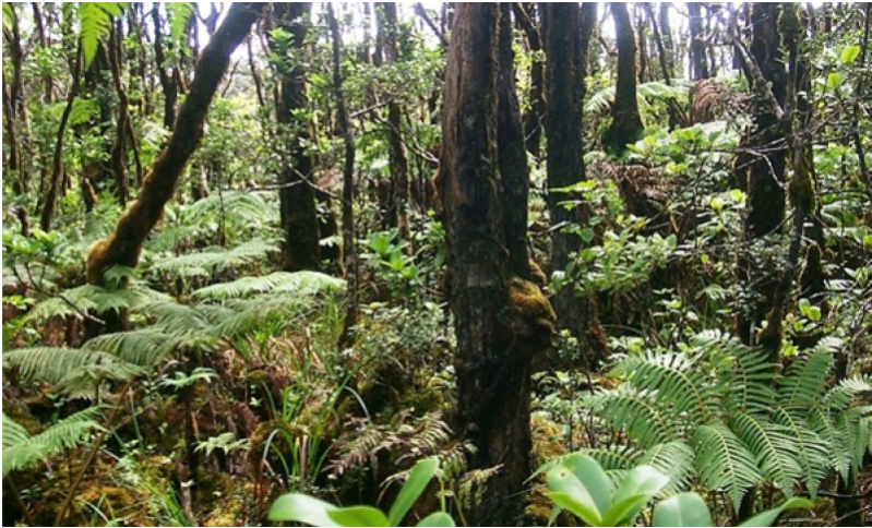
Figure 14. Transition upslope to F164XY500. 8/8/06 D Clausnitzer MU426

This community phase is a wetland with low stature trees, scattered tree ferns, and diverse shrubs, forbs, vines, grasses, and sedges. The soil surface is covered by a deep (1 to 2 feet or 30 to 45 centimeters) layer of sphagnum moss. The tallest plants typically range from 4 to 15 feet (1.3 to 4.6 meters) tall. In some areas, the overstory may be as short as 3 feet (1 meter) or as tall as 30 feet (9 meters). Trunks and branches of trees and shrub are covered by a heavy growth of mosses, liverworts, and small ferns. Most, if not all, the species occurring in the Reference State are typical of other Hawaiian moist forests.