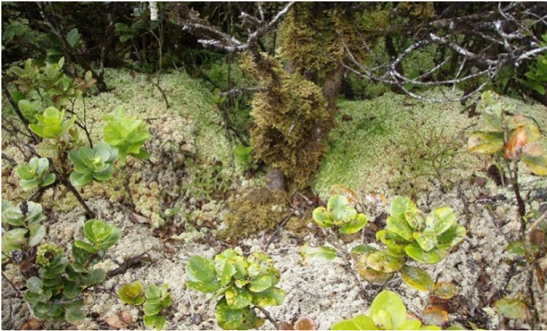
Figure 11. Closeup of sphagnum surface. 4/23/08 D Clausnitzer MU426