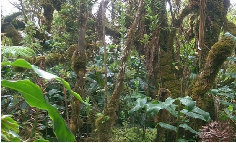
Figure 15. Understory invaded by kahili ginger. 11/8/06 D Clausnitzer MU426

This community phase has an intact or diminished overstory of native trees with a dense understory of native and introduced forbs, shrubs, ferns, grasses, and small trees.