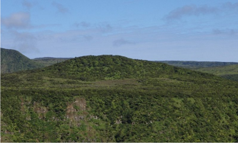
Figure 8. Plateau side view. 9/11/08 D Clausnitzer generic photo