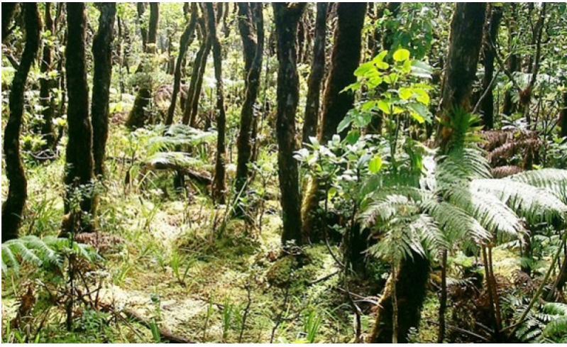
Figure 13. Site with taller trees. 8/8/06 D Clausnitzer MU426