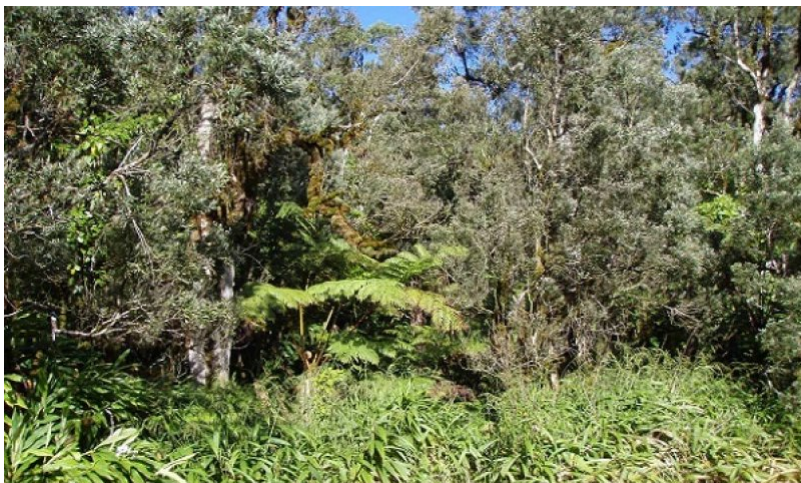
Figure 16. Melaleuca overstory with kahili ginger understory.