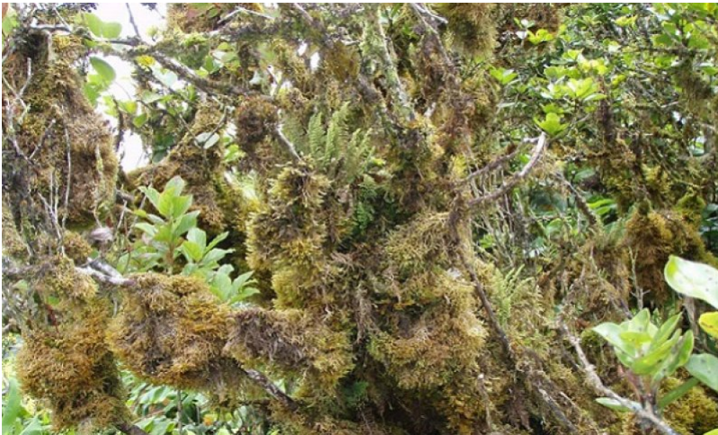
Figure 12. Heavy moss growth on tree trunk. D Clausnitzer generic photo