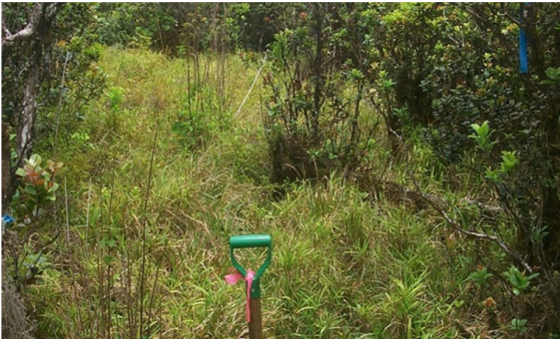
Figure 18. Hilograss dominating soil surface. 4/27/07 D Clausnitzer MU426

This community phase may have a few remnant native trees and tree ferns. Introduced species dominate all strata.