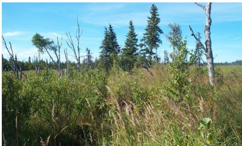
Figure 3. Typical area of community 2.1.