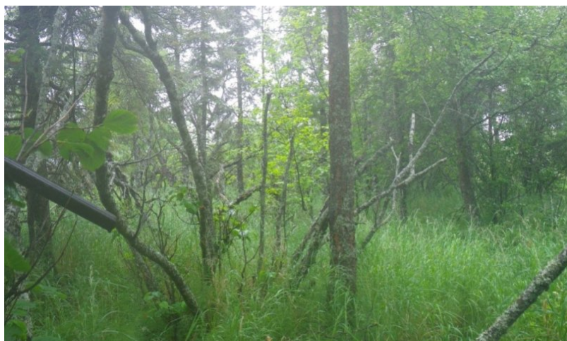
Figure 1. Typical area of community 1.1.