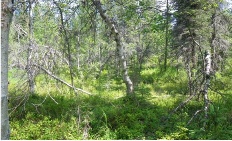
Figure 9. Typical area of community 1.1.