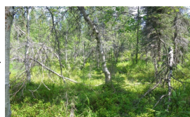
White spruce-paper birch/strawberryleaf raspberry- spirea/woodfern/bluejoint grass forest

Natural succession: Normal time and growth without disruptive ponding. As ponding subsides over time, facultative or obligate species become less competitive. This allows existing species that are less water tolerant to increase in abundance, commonly including an increase in the rates of colonization and growth of trees. The addition of a canopy increases the number of niches, particularly among shade-tolerant species; therefore, the abundance and richness of shrubs and forbs typically increase and those of bluejoint grass decrease. The period needed for this transition currently is unknown. It likely begins after active ponding ceases and is partially determined by the rate of propagule spread and growth rate of trees and shrubs.