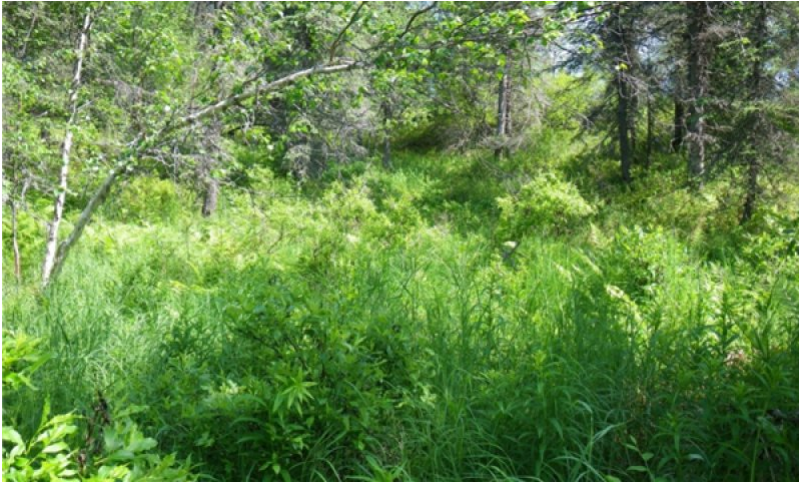
Figure 11. Typical area of community 1.2.