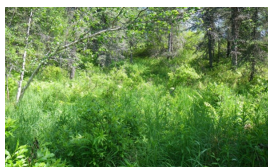
Barclay's willow/bluejoint grass/fireweed open scrubland

Ponding. Ponding of the reference plant community likely will drown many of the species, particularly extant trees. The resulting decrease in competition for space and light will allow existing hydrophilic species to spread and facultative or obligate wetland pioneer species to be recruited. Occasional, very brief periods of ponding occur in April through October. A much longer period of ponding likely is required to drown sufficient extant trees and shrubs in the reference community phase to support an early ponding community phase.