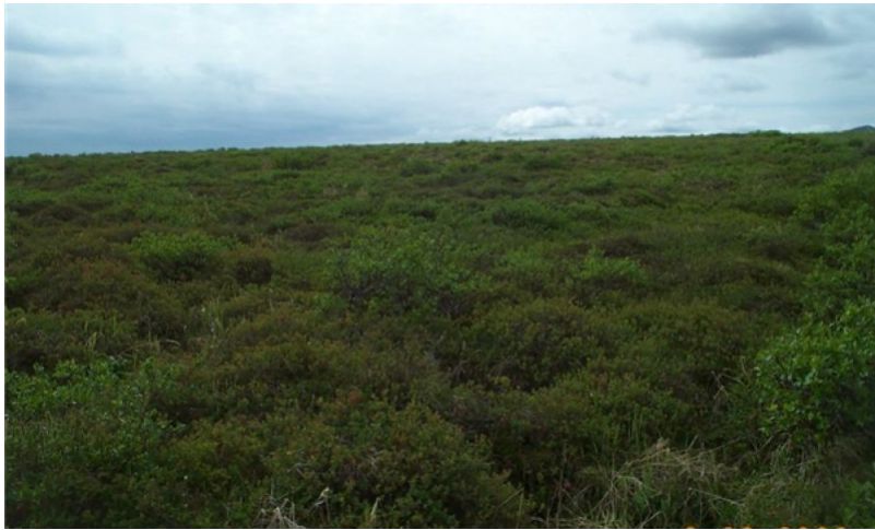
Figure 9. Typical area of community 1.1.