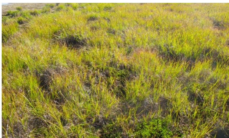
Figure 1. Typical area of community 1.1.