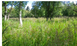
Kenai birch-white spruce/red raspberry/bluejoint grass/northern bedstraw-woodland horsetail woodland

The reference plant community is resilient to flooding disturbances. An atypical shift is site hydrology can decrease the effects of flooding. Slower growing, less hydrophytic plants colonize and grow. A woodland may develop on this landform if the site hydrology remains dry for an extended period.