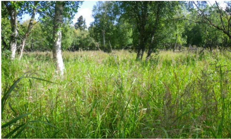
Figure 10. Typical area of community 1.3.