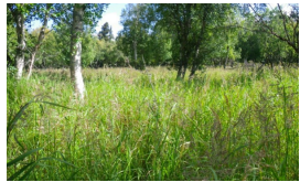
Kenai birch-white spruce/red raspberry/bluejoint grass/northern bedstraw-woodland horsetail woodland