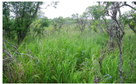
Willow-arctic raspberry/bluejoint grass/Canada goldenrod-Canadian burnet open scrubland

The return of the typical site hydrology increases hydrophytic pressures on vegetation. Plants susceptible to a high water table and mechanical scouring die back. Hydrophytic shrubs and herbaceous plants increase in foliar cover.