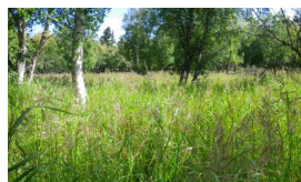
Kenai birch-white spruce/red raspberry/bluejoint grass/northern bedstraw-woodland horsetail woodland