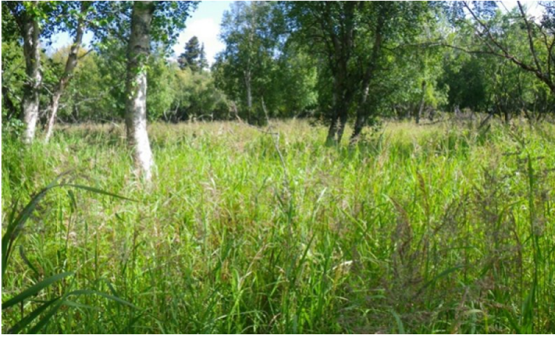
Figure 10. Typical area of community 1.3.