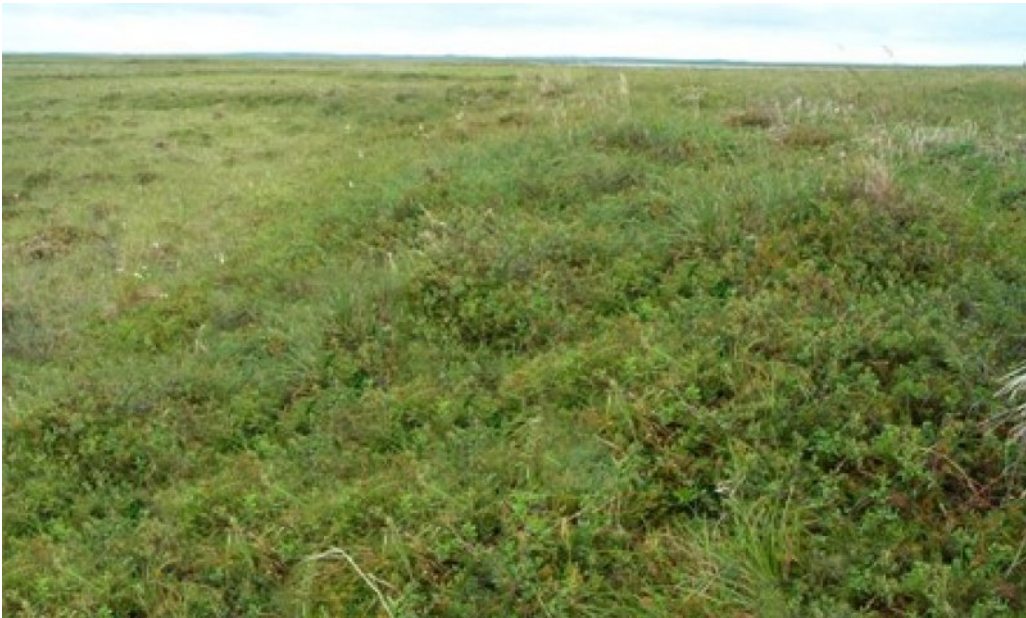
Figure 3. Community 1.1