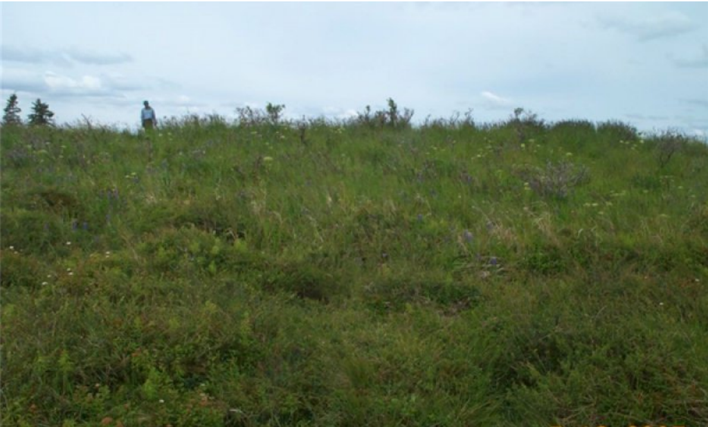
Figure 5. Typical area of community 1.2.