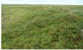
Bog blueberry-black crowberry-dwarf birch-marsh Labrador tea/moss scrubland