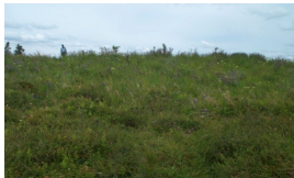
Bluejoint grass/Lapland cornel/seacoast angelica- Nootka lupine meadow