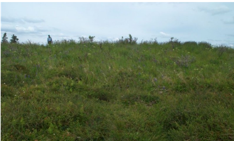
Figure 5. Typical area of community 1.2.