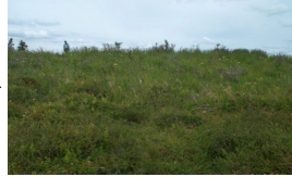
Bluejoint grass/Lapland cornel/seacoast angelica- Nootka lupine meadow

Erosion. This site may be subject to erosion by wind, rain, and landslides as a result of the loss of plant cover from browsing, animal movement, or nearby frost heave. Post-disturbance, unvegetated areas generally will be populated by fast-growing, pioneer species of graminoids and forbs. This transition is expected to begin immediately after major erosion.