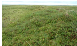
Bog blueberry-black crowberry-dwarf birch-marsh Labrador tea/moss scrubland

Natural succession: Normal time and growth without disruptive erosion. As this community develops, the landform likely will stabilize and organic matter from senescent pioneers will accumulate. Low and dwarf shrubs that can compete for light and space and withstand the abiotic conditions on the exposed, steep slopes likely will colonize and reproduce. The period needed for this transition is unknown. It likely depends at least partially on the rates of colonization, growth, and reproduction of shrubs.