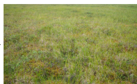
Dwarf birch-sweetgale-marsh Labrador tea/bluejoint grass-sedges/purple marshlocks/moss scrubland

Decreased hydrologic pressure allows less hydrophytic species to colonize and develop sustaining populations. Decreases in precipitation or run-off from surround landforms may be a primary cause. Additionally, the continued build up of the organic layer can lower the associated water table, creating relatively drier soils in the area