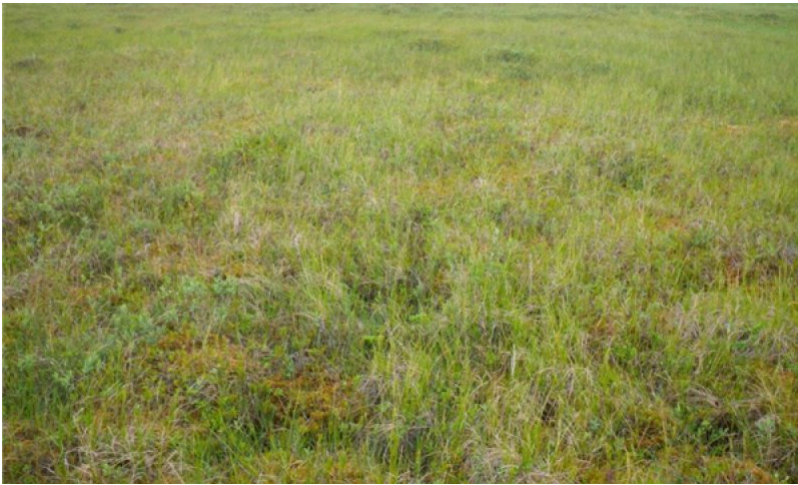
Figure 8. Typical area of community 1.1.