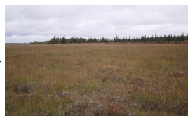
Sedges-cottongrasses/purple marshlocks-water horsetail/sweetgale-dwarf birch/moss open scrubland

Increased hydrologic pressure further restricts plant species to mostly facultative wet to obligate wetland species. Increased hydrologic pressure is caused by increased water input into the depression. Greater precipitation, more run-off input or a longer ponding period may cause this. Fire is expected to be a rare occurrence in this site.