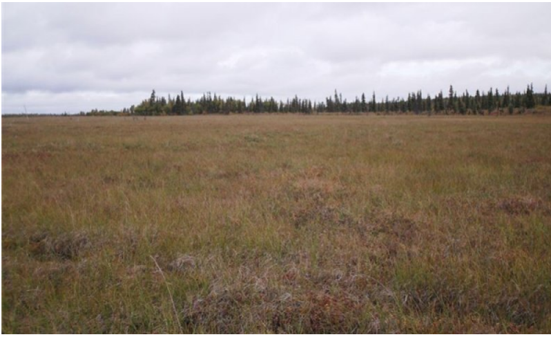
Figure 10. Typical area of community 1.2.