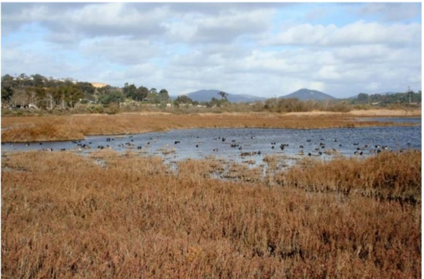
Figure . San Elijo Lagoon.

Community Phase 3.1 – this community phase will be dominated primarily by cattails, pondweeds, and other brackish and freshwater emergent species. It may vary from a rather complex variety of cover and distribution of species much like a marsh might appear, but it also may look more like a pond or wetland depending on how disconnected it has become from the hydrologic functions and dynamics of the ocean tides.